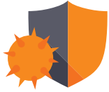
Antivirus & Anti-malware

Avast delivers easily managed cloud-based and on-premise business security solutions for PCs, Macs, and servers. We protect more than 230 million endpoints globally, which provides your organization with the most-trusted security in the world.