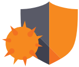
Antivirus & Anti-malware